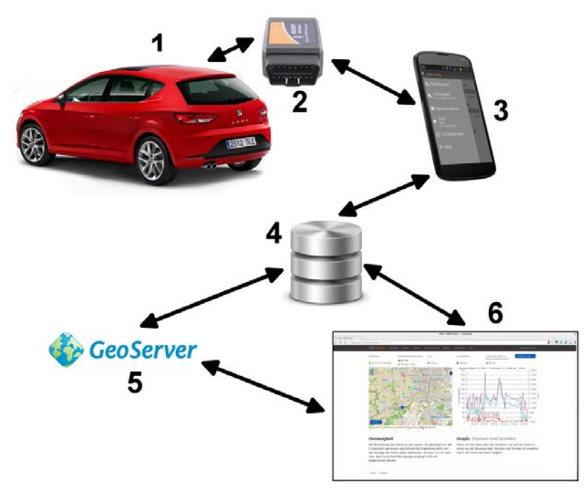
Figure 1: Architecture of the used prototype.

At the University of Münster a group of Students implemented a novel Internet platform called enviroCar , where a community of car drivers is able to collect their cars' sensor data and share this data on the community platform. For enviroCar the students implemented a server component with a publicly accessible API, an Android application and the website front-end. The whole project aims at publishing environmentally relevant sensor data in order to provide this data to citizen scientists.