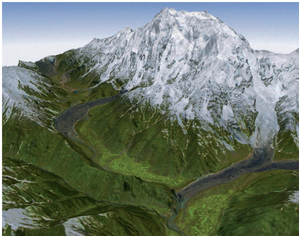
Fig. 2: Perspective view on the Nanga Parbat obtained from a digital terrain model derived from SRTM-data, over which a SPOT image was draped. The SPOT image was provided by CNES/SPOT Image.

What is the future of Space Photogrammetry? Space missions with photogrammetric cameras with large film format for stereoscopic imaging are out since 1984. Instead of them the along track stereo imaging principle introduced by the German MOMS mission was accepted as a reliable method and will be used in various photogrammetric space missions: